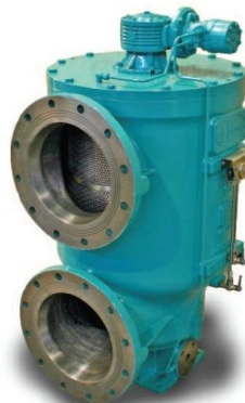
Lube Oil ACP & ACX Type